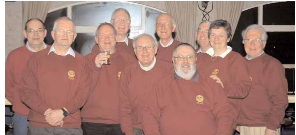
Totnes TeamPlay Deck Quoits - Paignton on the 27th February 2008